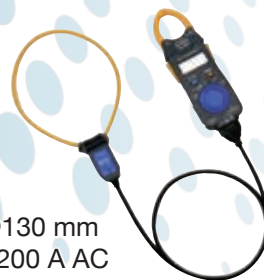
Φ130 mm 4200 A AC