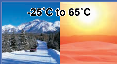
-25°C to 65°C