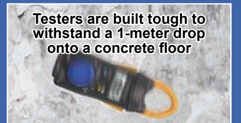
Testers are built tough to withstand a 1-meter drop onto a concrete floor