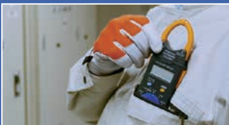
Fits in your pocket