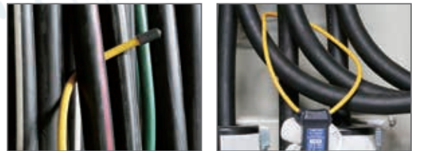
AC FLEXIBLE CURRENT SENSOR CT6280